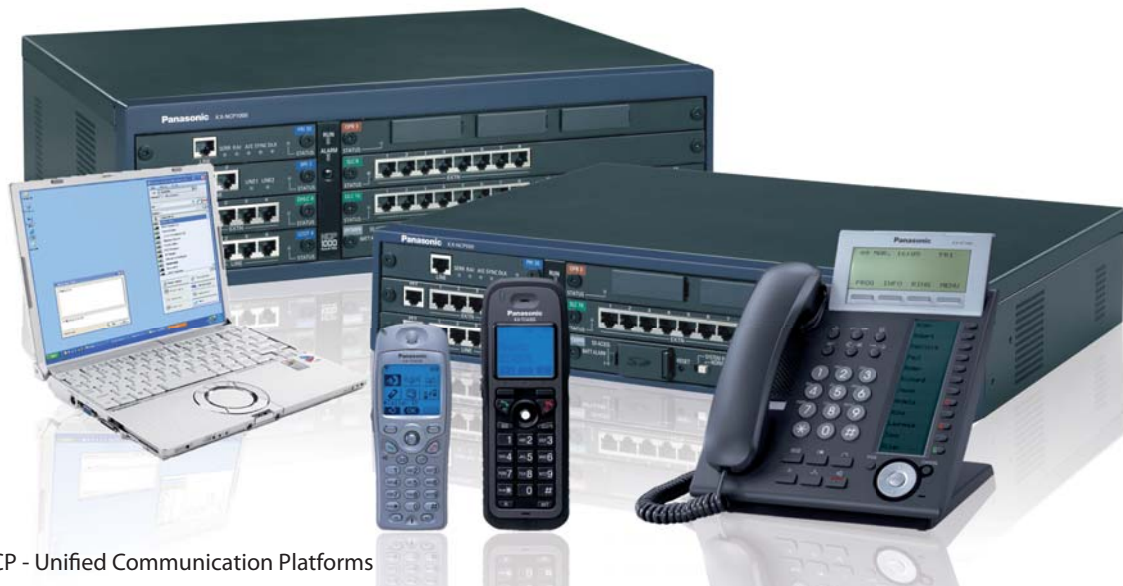
KX-NCP - Unified Communication Platforms

Enhance your business with a platform to enable unified communications - designed to handle the dynamic nature of high-speed multi-faceted business communications of today. KX-NCP platforms - helping to connect all your users with customers - wherever they may be.